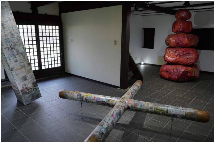
Installation view of Group Exhibition '山怪〜異世界への憧れと畏れ' at 瑞雲庵 (2021)