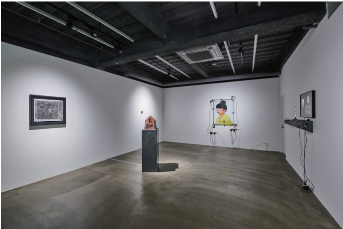
Installation view of Solo Exhibition 'WOODS' at TEZUKAYAMA GALLERY (2017)