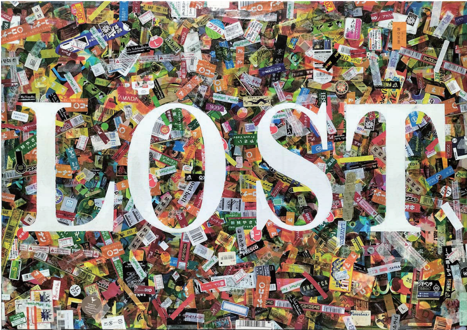
LOST / 2024 / 木枠、キャンバス、ジェッソ、シール、アクリル絵具など / H595 × W840 × D25 mm