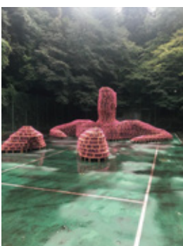
*1 Rokko Meets Art 2020

Just like wild thought, even if the tribes as generations differ, the fundamental structure remains the same and there is no superiority or inferiority. The relationship between tennis balls and spokes that I experienced, while unable to withstand various pressures, represents one of the countless expressions that have emerged and vanished since the beginning of human history. These expressions will continue to evolve, separate from loud social efficiency.