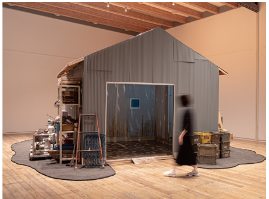
“inside out” 2020 / Borrowed items from the foundry, borrowed items from Wooden pattern maker, tinplate, monitor, lumber