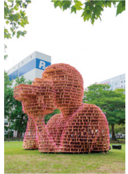
“pathfinder sculpture” 2023 / cord, plywood, nails