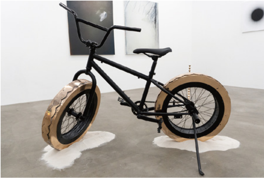
“live log” 2022 / BMX, Bronze, sand casting