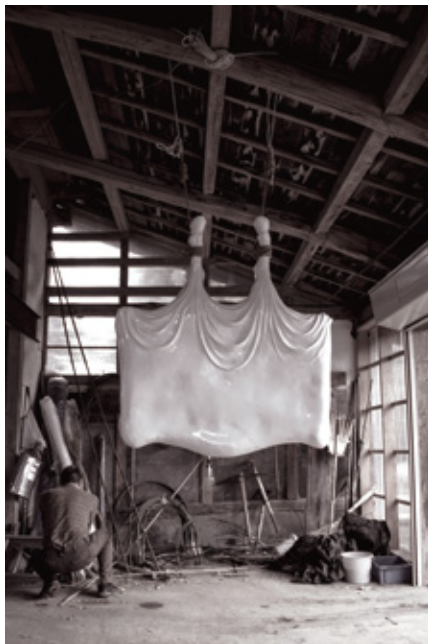
“wall of flesh” 2017 / FRP