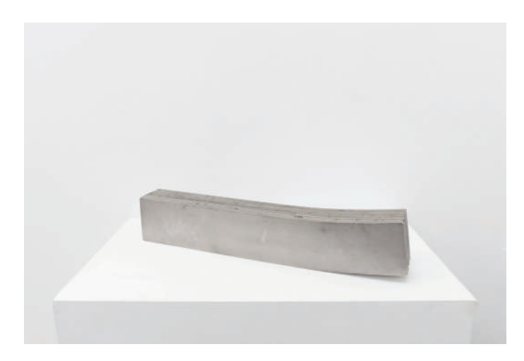
HEAVY METAL -032 2022 stainless steel H50 × W563 × D74 mm