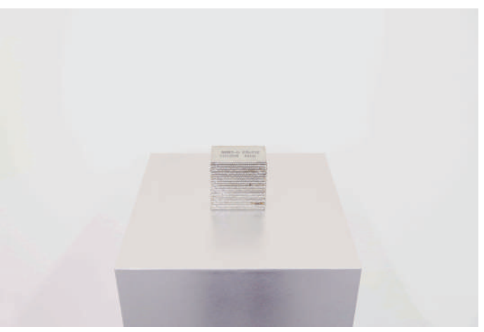
HEAVY METAL -4x50 2022 stainless steel H80 × W80 × D50 mm