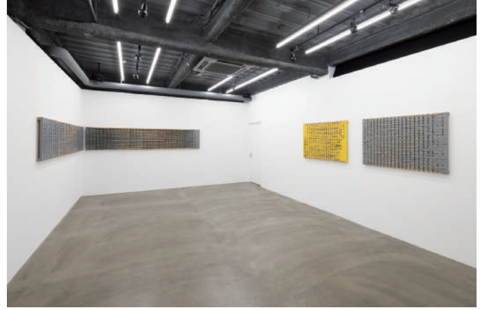
Solo Exhibition "Exhibition 2021" at TEZUKAYAMA GALLERY, Osaka (2021)