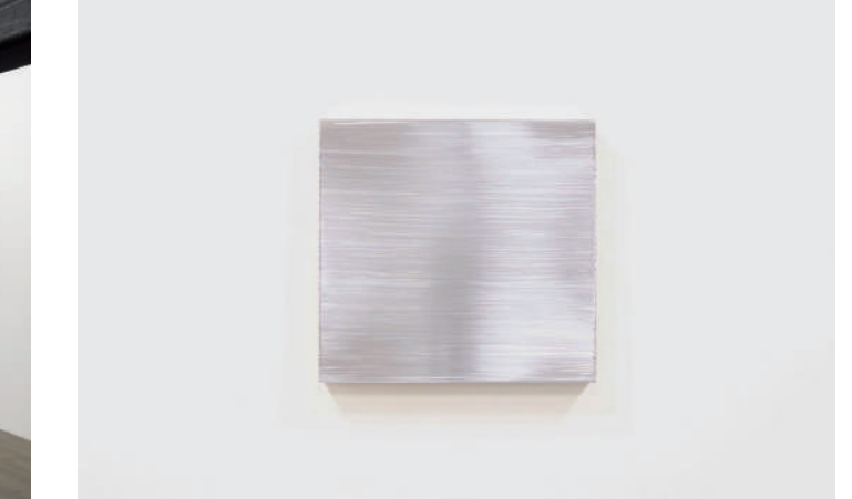
super skill touch #120 2022 stainless steel H414 × W436 × D57 mm