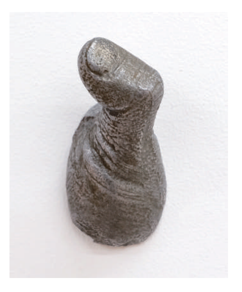
Tomio Miki, Finger, 1966, Aluminum