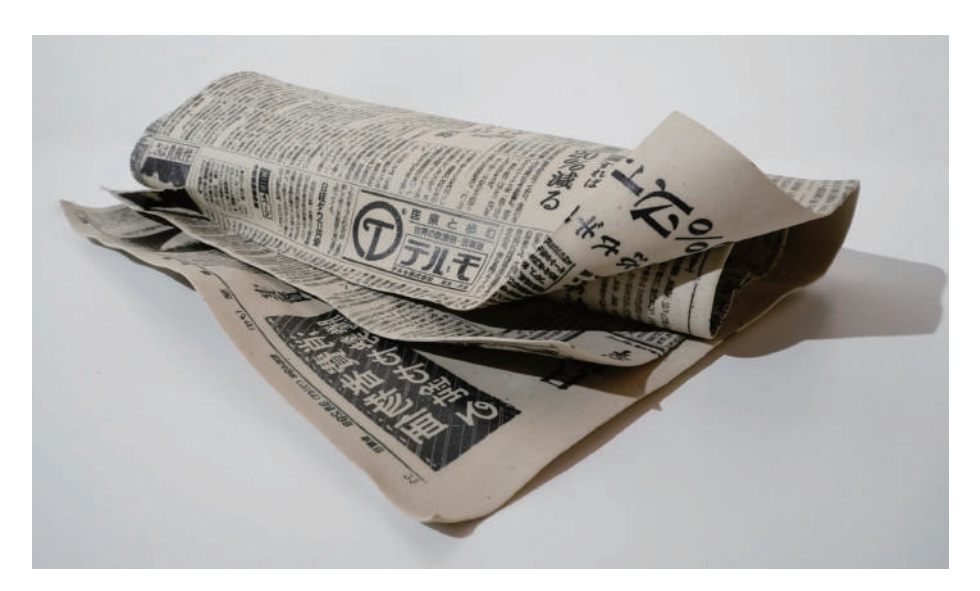
Kimiyo Mishima, Newspaper 74, 1974, Ceramic