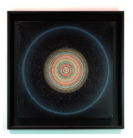
Tadasky Kuwayama, Untitled, circa 1960's, Aclylic on canvas