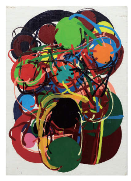
Atsuko Tanaka Untitled 1970 Enamel on canvas