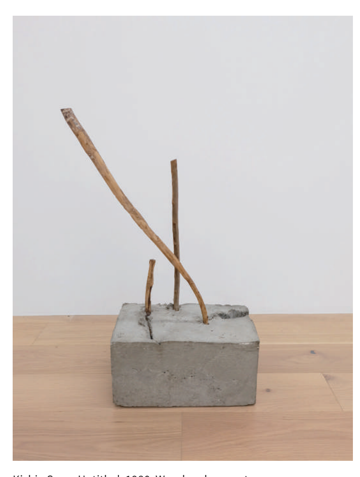
Kishio Suga, Untitled, 1980, Wood and cement