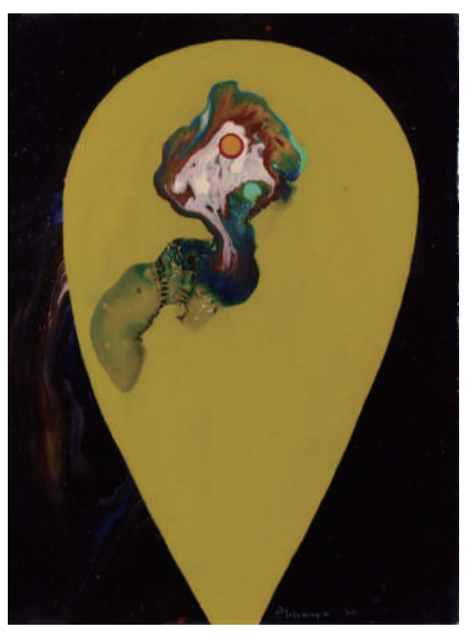
Sadamasa Motonaga Untitled 1966 Oil on canavs