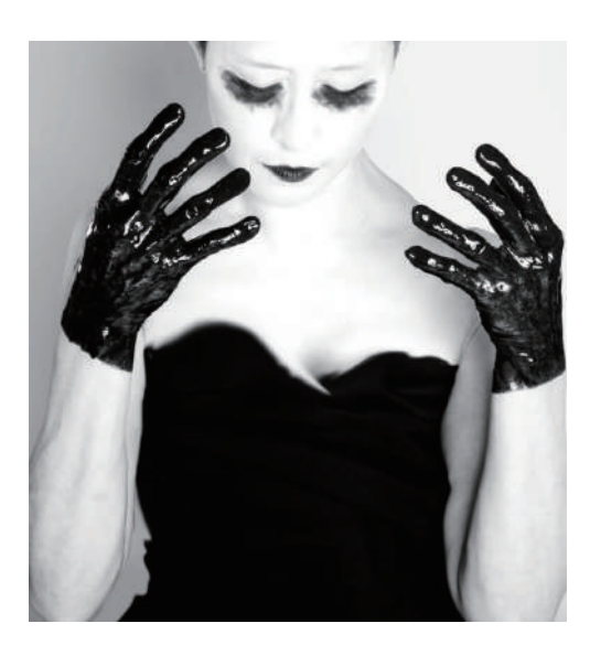
kagenowazurai #1, 2014 ink-jet print, H800×W740 mm

2015 FOTOFEVER | Carrousel du Louvre, Paris