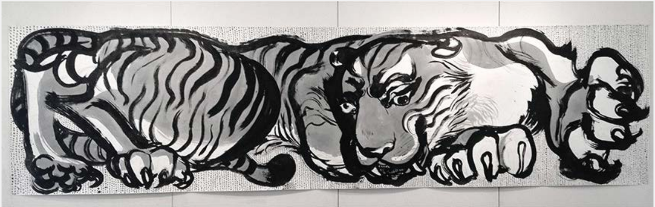
'Senritte-senrikaeru', 2013, Japanese ink on canvas, 107 x 360 cm