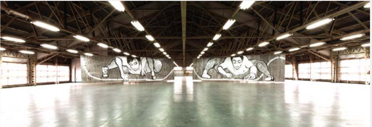
'Yukagaki Gensun', 2011, Japanese ink on canvas, 210 x 900 cm (each)