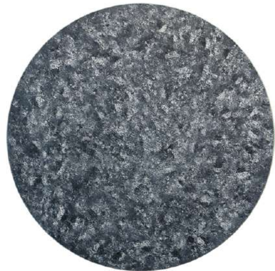
Big Bang acrylic, plywood φ120 x D2.2cm 2010