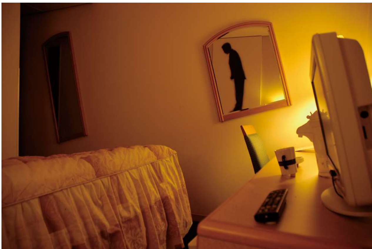
Installation View of Yuuki Tsukiyama Solo Exhibition at Hotel Granvia Osaka(ART OSAKA 2013), 2013