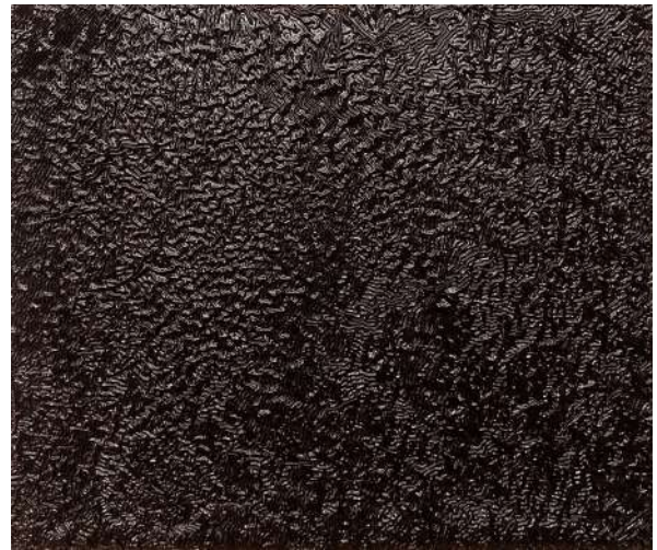
Timeline - Dive #1 cashew, acrylic, plywood H60.5 x W72.5 x D2.5cm 2014