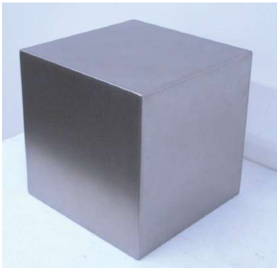
Cube - Stainless #2 stainless H16 x W16 x D16cm 2009