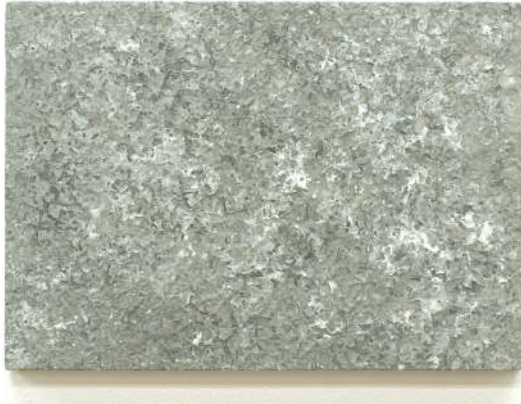
Fiction Painting - Gray acrylic, plywood H21.5 x W29.5 x D2.0cm 2014