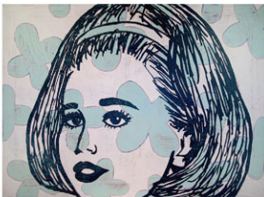
some girls 01 2012, acrylic on canvas