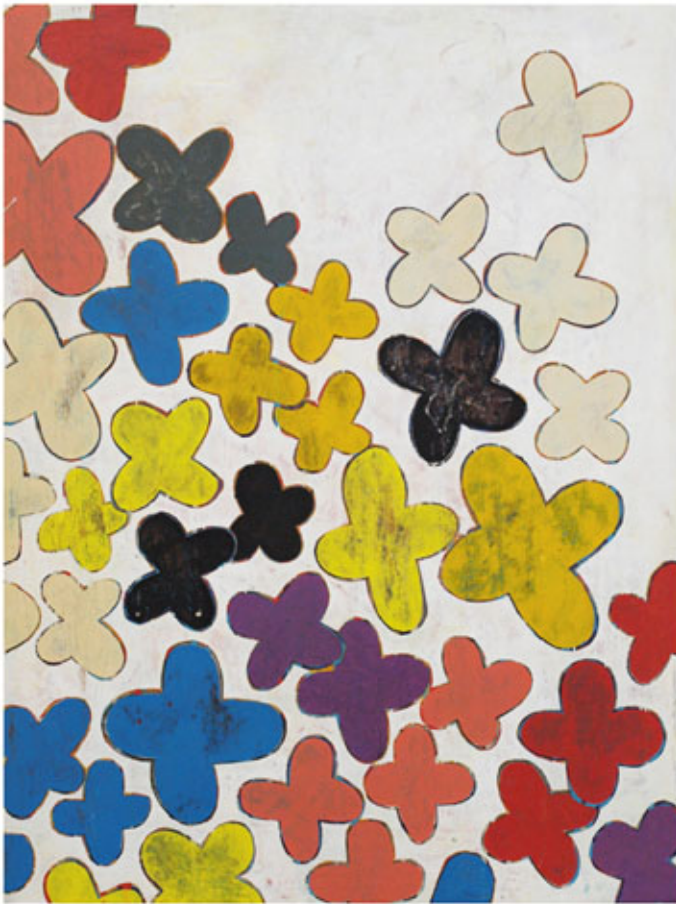
Dead Flowers 12, 2011