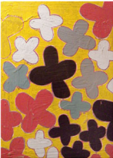
dead flowers 16 2011, acrylic on canvas