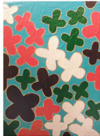
dead flowers 17 2011, acrylic on canvas