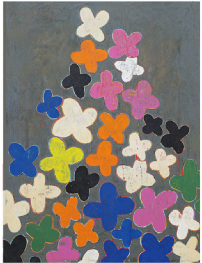
Dead Flowers 13, 2011