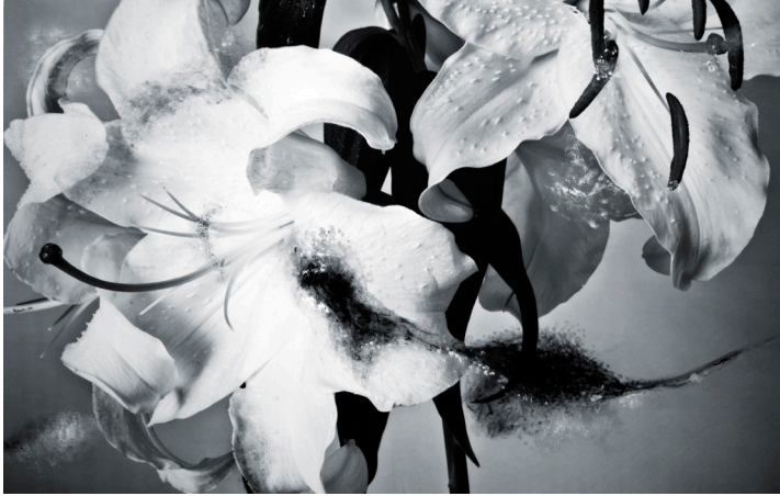
"Lilies preach the truth" From C.Rossetti, "Consider the Lilies of The Field" / 2012