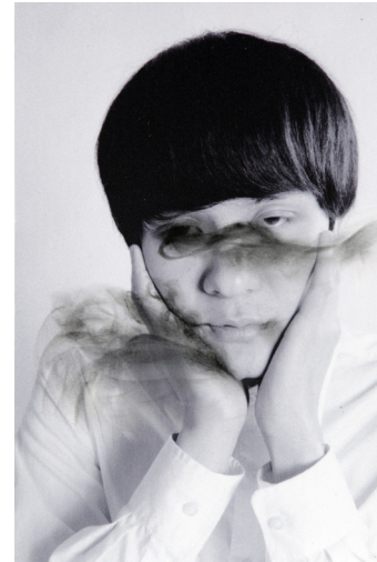
chaotic indication / 2012