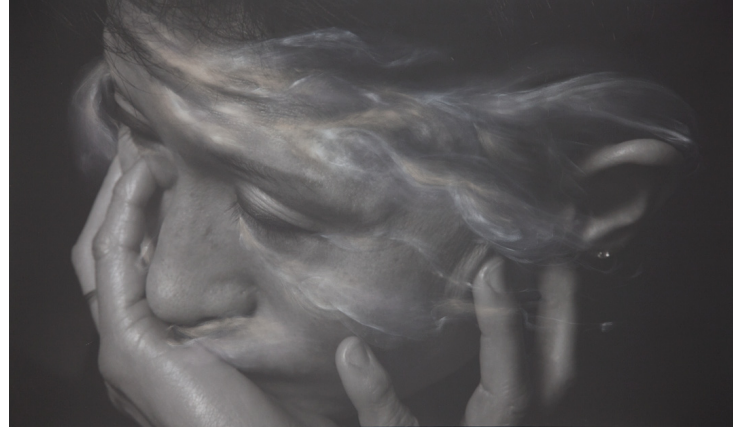
complex / Strong sense of beauty / 2011