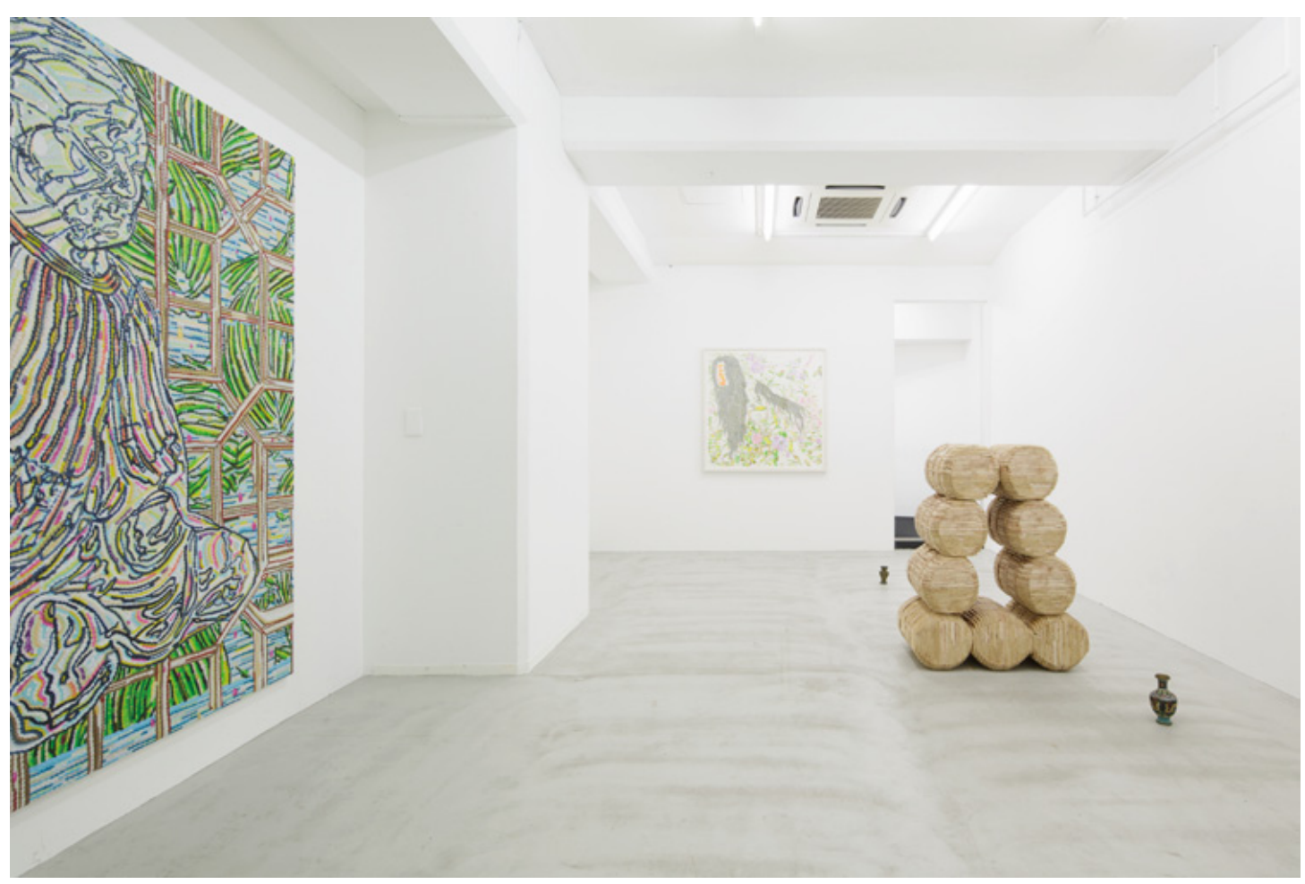
Solo Exhibition "Float" at AISHO MIURA ARTS 9th Feb - 2nd Mar, 2013