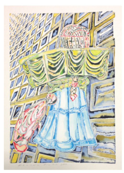
'Untitled' 2012 watercolor on paper 36 x 26.5 cm