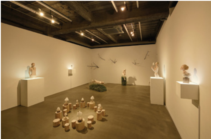
Exhibition View: 上原浩子 個展「Deep Forest」, 2018 / TEZUKAYAMA GALLERY