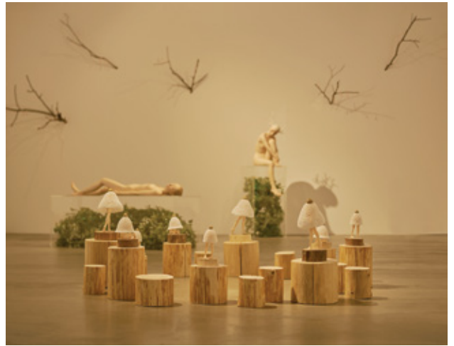
Exhibition View: 上原浩子 個展「Deep Forest」, 2018 / TEZUKAYAMA GALLERY