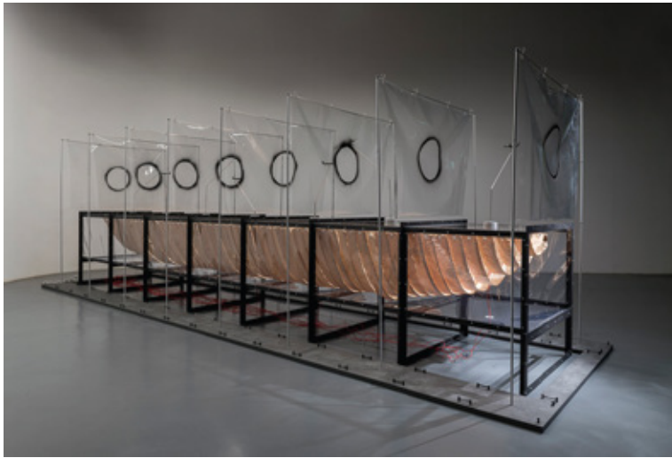
ディスタンス 21497, 2020, ビニルシート,帆布,鉄,旅客機の模型,モーター,他, H2030 x W1950 x D6750 mm