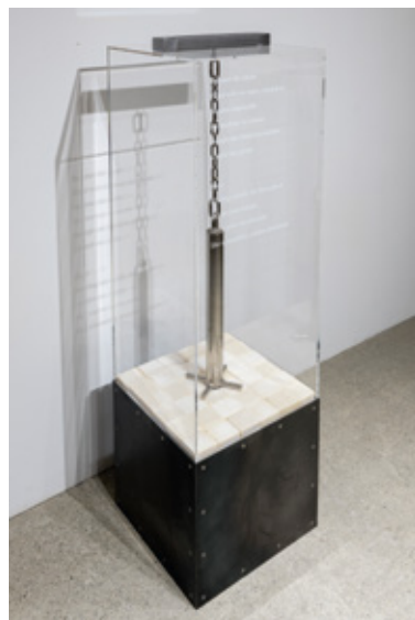
(L to R) 対称性の破れ (世界の始まり) 2019 斧、包帯、タイル...他 H1210 x W410 x D380 mm