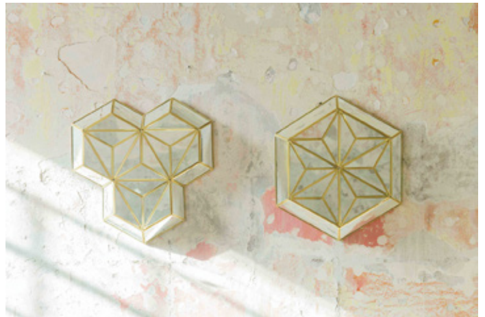
kaleidoscope no.3 / 2021 / mirror, brass