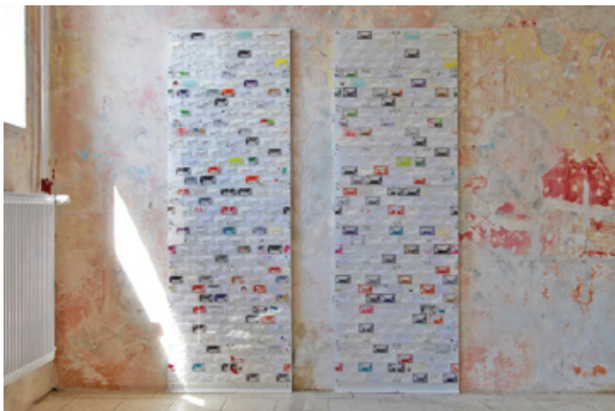
monos no.2 / 2019 / business card, plexiglass, magnet, screw, wooden panel