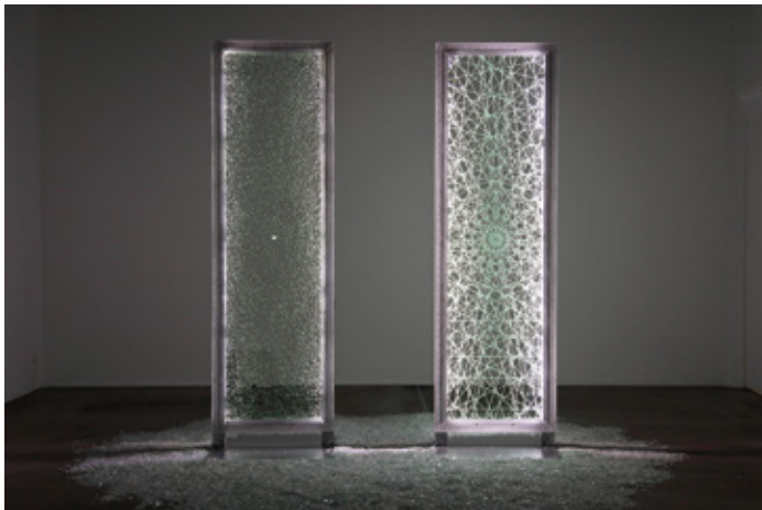
Exhibition View: Solo Exhibition 'tear' (2016) / TEZUKAYAMA GALLERY - Main Gallery