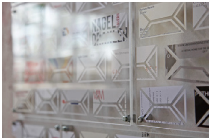
monos no.2 - detail / 2019